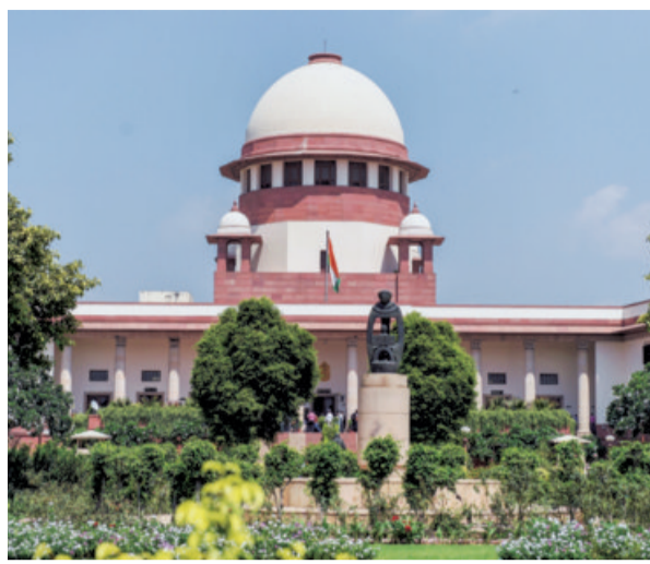
The apex court was hearing a petition alleging that certain provisions of Muslim personal law infringe on the rights of women. The top court said UCC could be the way out

During the hearing, the Bench also questioned the petitioners regarding their challenge to the Muslim Personal Law (Shariat) Application Act, 1937, which they