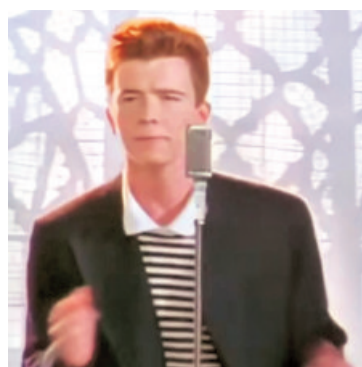
Rick Astley in the 1987 music video of "Never Gonna Give You Up," the song that is part of a viral prank, popularly referred to as 'rickrolling'

"While the concern about the veracity of the question papers has been put to rest, the matter has been viewed seriously and necessary steps are being taken by the Board to ensure that such issues are not repeated in the future,"